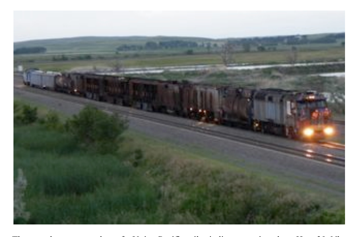
The two photos were taken of a Union Pacific rail grinding operation along Hwy 30, Nb.

simultaneously employed to create a new railhead contour. One rail grinding service says their machines can do the job at a dozen miles per hour with something like two to three dozen grinding wheels working on the track at the same time.